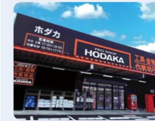
Hodaka Co., Ltd. (57 stores)

Specialty store offering tools, hardware, work supplies, and work clothes. Hodaka aims to be a store that satisfies everyone, from professionals to general customers, who are particular about their tools.