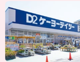
Keiyo Co., Ltd. Equity-method affiliate (164 stores)

Through business development leveraging comprehensive Group strengths, the DCM Group protects customer lives even in emergency situations by offering a wide range of disaster prevention equipment in addition to the best products and services for resolving problems and meeting needs in support of the desire for a better life.