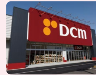
DCM Co., Ltd. (506 stores)